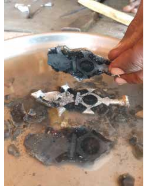
The hot mold is dropped into water and broken apart with a few blows of a hammer.

He adds more charcoal to the fire and uses the bellows to bring the fire to high heat. The crucible is filled with silver, set on the hot coals, and covered with more coals. The mold is also set on the coals to burn out remaining wax residue and so it will be hot when the silver is poured in. When the metal is melted, typically less than 10 minutes, Kammo sets the hot mold, funnel up, in a pile of sand near the fire. He carefully clutches the glowing crucible with tongs and pours the molten silver into the mold.