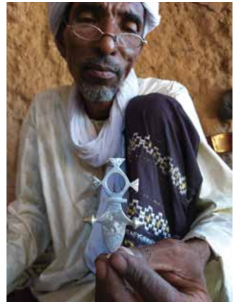
The cross is examined again after the cones have been forged and filed.