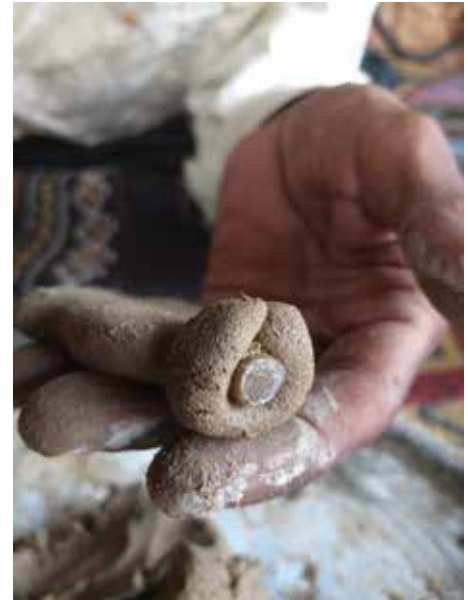
This roll of clay will be shaped into a funnel that will guide molten metal into the mold.