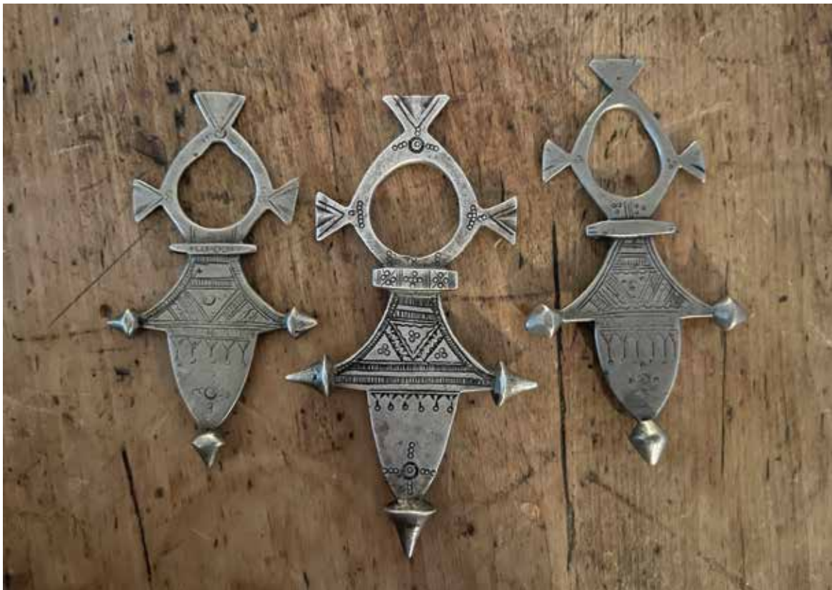
These three Iferouane crosses have almost identical engraving and stamping even though they have been made of different generations of jewelers.