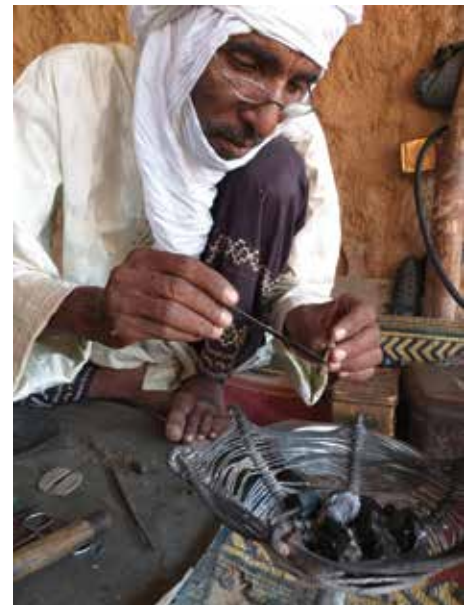
Pieces are fused together by touching them with a blade heated over a charcoal brazier.

he lays across the model just below the hole. As wax pieces are added, they are fused in place by touching the joint with the knife blade that has been warmed over the coals.