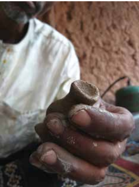
The funnel where the wax will drip out and later the molten metal will be poured in.