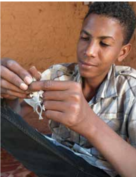
As is often the case, sanding is done by a young apprentice, often a relative.