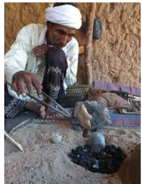
To remove the small amount of wax residue lining the interior cavity, the mold is placed back on the coals and taken to a higher heat. The crucible filled with silver is sitting nearby.