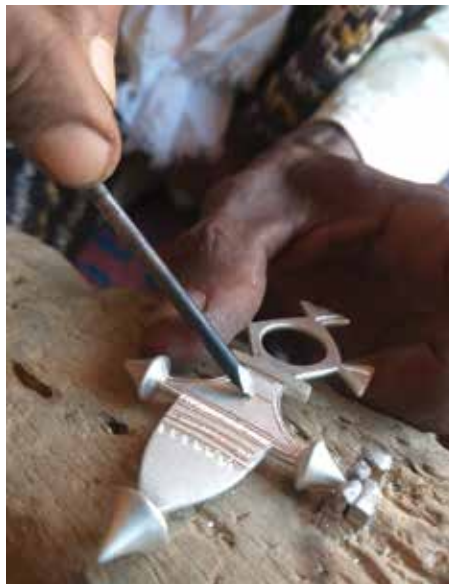
Using a graver made from a small screwdriver, the surface is engraved with traditional patterns.