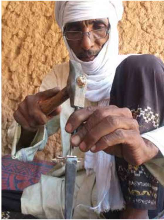
In addition to engraving, Iferouane Crosses usually also include stamped decorations.