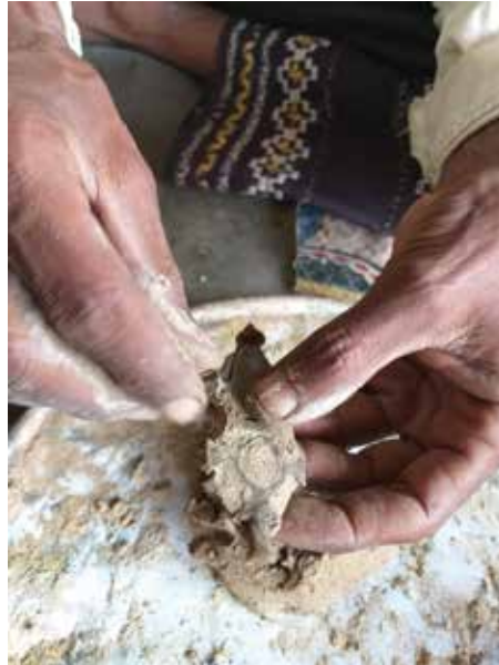
A mixture of sand, clay, and fibers is pressed gently around the model.