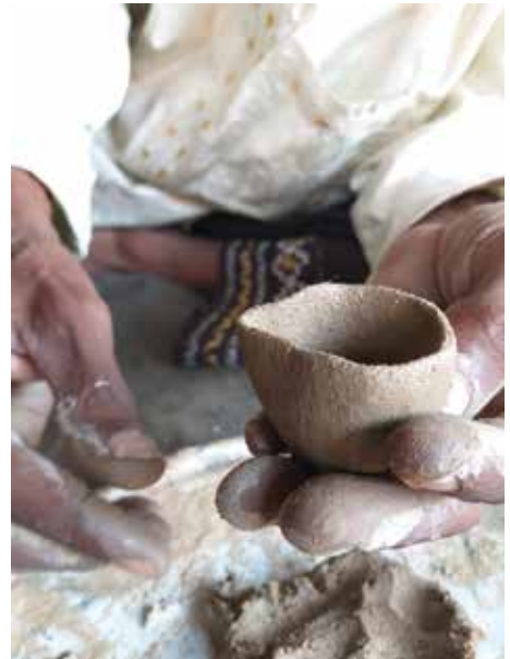
The finished crucible where the silver will be melted and then poured.

To make the mold, Kammo uses a mixture of fine clay, sand and donkey dung. The donkey dung offers natural fibers that have been broken down to the perfect size through the animal's digestive process. The fibers prevent the mold from cracking as it dries.