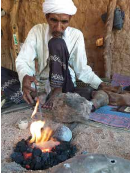
The mold is brought to a high heat by working the sheepskin bellows.