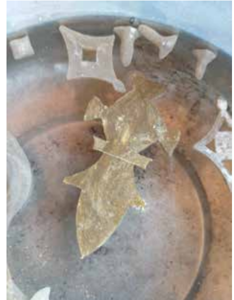
He then cuts the precise outline with a blade and adds horizontal bars. Additional work is seen floating in his bowl of water.