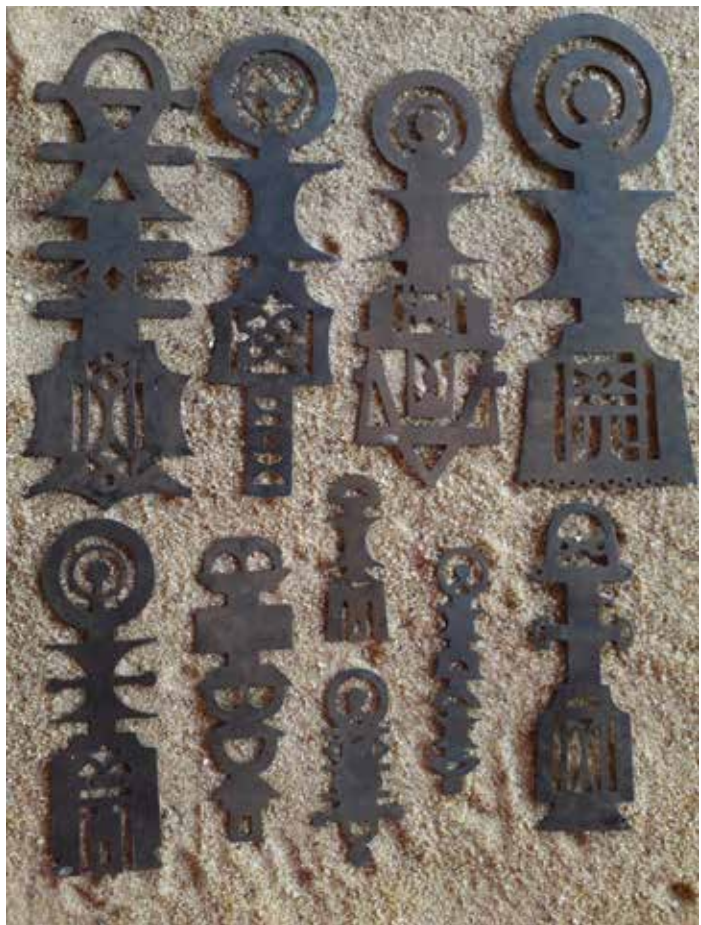
Templates passed down to Omar from his father and grandfather.

In the next chapter, you can see a traditional Touareg lock and the set of metal pieces that are the keys. In the old days, the keys were much larger than today. Touareg women used to attach a key to a corner of their veil that they would pass over their left shoulder, allowing the key to hang down their back. This was a way to keep the key with them at all times and to show their wealth. A further benefit of this system was that the keys provided a weight that would hold the head scarf from flying in the wind. In time, the keys evolved into an ornament that has the look of the old keys, though sometimes larger and always decorated with metals of different colors. In French, “ clé de voile ” means veil key but it is known as a veil weight in English.