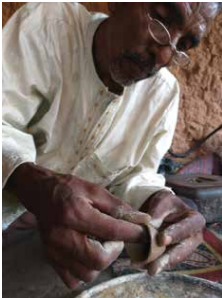
A ball of the same clay mixture is used to make a small cup called a crucible.