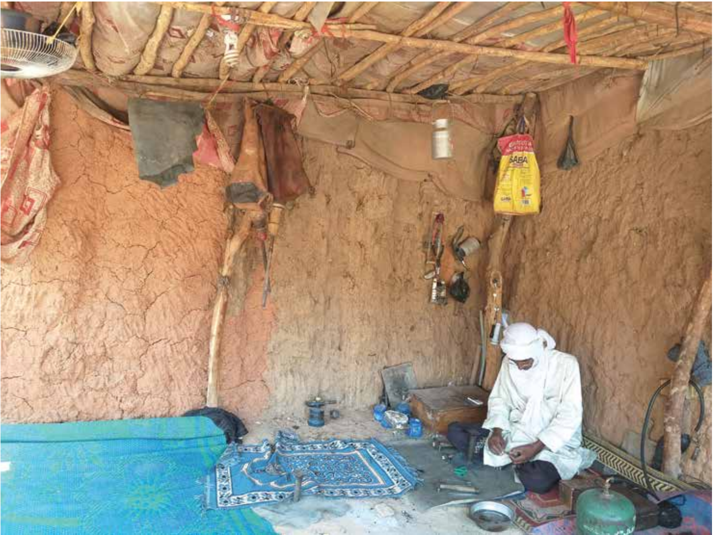
Kammo's workshop, set on the side of his house. Two others artisans share his work space.

the center of the ball with his thumb. By pressing all around the sides, he opens it up into a small cup; he pinches the edges to form a pouring spout. The crucible is set to dry next to the mold of the cross. It is best to let the clay mixture dry slowly, rather than directly in the sun. Slow drying prevents the mold and the crucible from cracking.