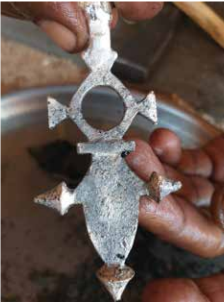
The casting as it appears when the mold is broken away. The sprue at the top what will cut off.