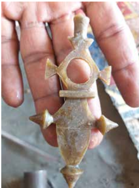
The center hole is cut and cones are added to three points. Note the wax rod at the top (sprue) which is where metal will enter the mold.