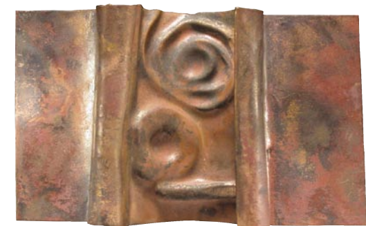
The same piece, front and back, showing the possibilities of trapping hard “tools” under the table returns.