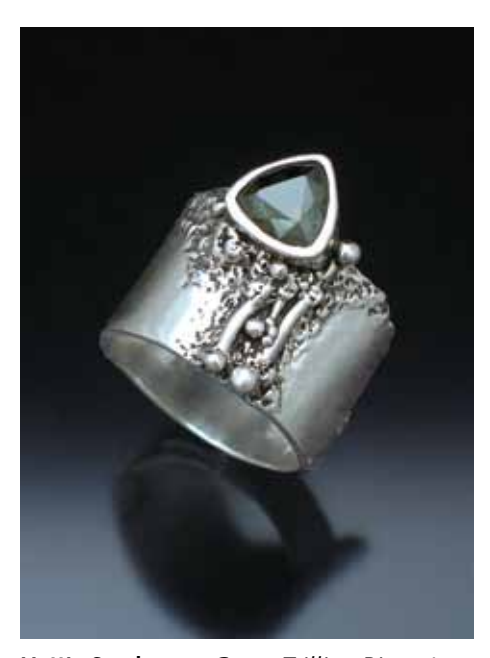
Hattie Sanderson, Green Trillion Ring , sterling silver metal clay, lab-created gemstone.