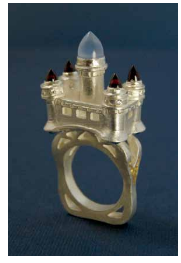
Jennifer Smith-Righter, Castle RIng , fine silver, gold, chalcedony, garnets, CZs.

jar. Use a dedicated water container for each type of metal clay. A fine mist sprayer is handy for adding water to clay as needed.