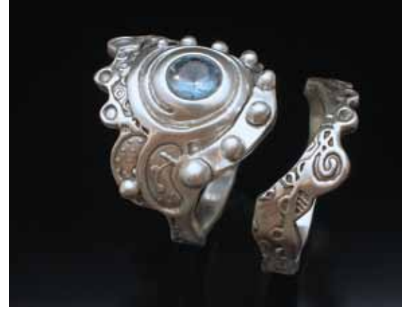
Julie Beuchereie, Blue Moon , fine silver, moonstones, lab-grown sapphires. Photo by the artist.