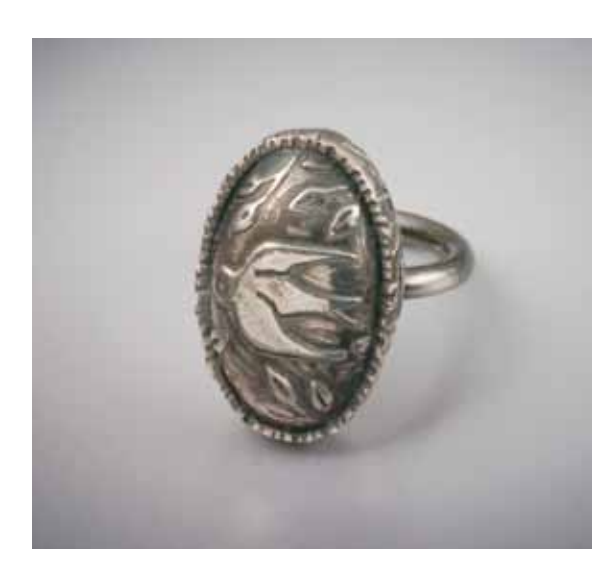
Vickie Hallmark , Swallow , fine silver and wire.

You can make your own textures in a variety of ways. Suppliers carry materials and tutorials for making textures from your own designs in photopolymer plates, laser cut paper or etched copper. Another option is to send your artwork to a rubber stamp manufacturer such as Ready Stamps (www.readystamps.com).