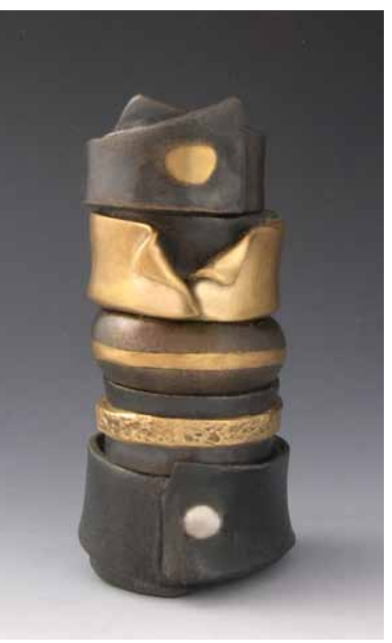
Hadar Jacobson, Tower of Rings , steel, bronze, and silver clay.

To make your own slip, spread fresh clay on a work surface with a palette knife and work in distilled water until it forms a thick slip. Scoop the slip into a